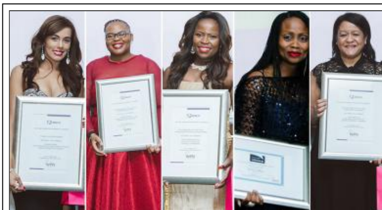
The South African Women in Property Awards seeks to recognise an exceptional woman within the property industry.